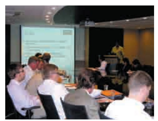
Dubai study visit

As an avenue to boost Singapore's global prominence and build mutually-beneficial relationships as well as to better understand what developments and trends are taking place, CEU manages the visits to ACRA and facilitates training attachments with ACRA as well. For the last year, ACRA hosted approximately 150 visitors from more than 30 organisations all over the world.