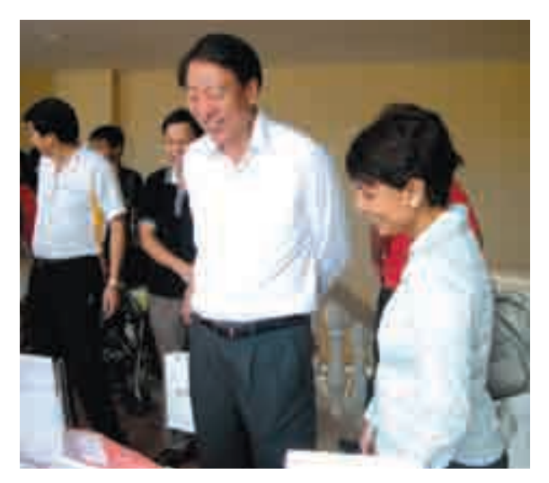
Doing Business in Singapore seminar

Entitled "Doing Business in Singapore", the talks are organised by the Business Facilitation Division (BFD) and the Client Engagement Unit (CEU). Conducted at Community Centres/Clubs (CC), the inaugural talk was held at the Pasir Ris Elias CC on 20 October 2007. The turnout of about 230 people and the positive feedback indicated that there was interest and demand for business-related public education to inspire and support budding entrepreneurs and contribute to the vibrancy of the business landscape. The ACRA @ Heartlands talks have since become part of ACRA's on-going efforts to promote public awareness on doing business in Singapore.